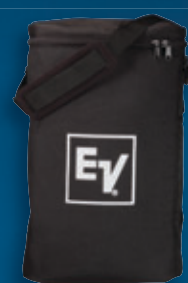
padded gig bag